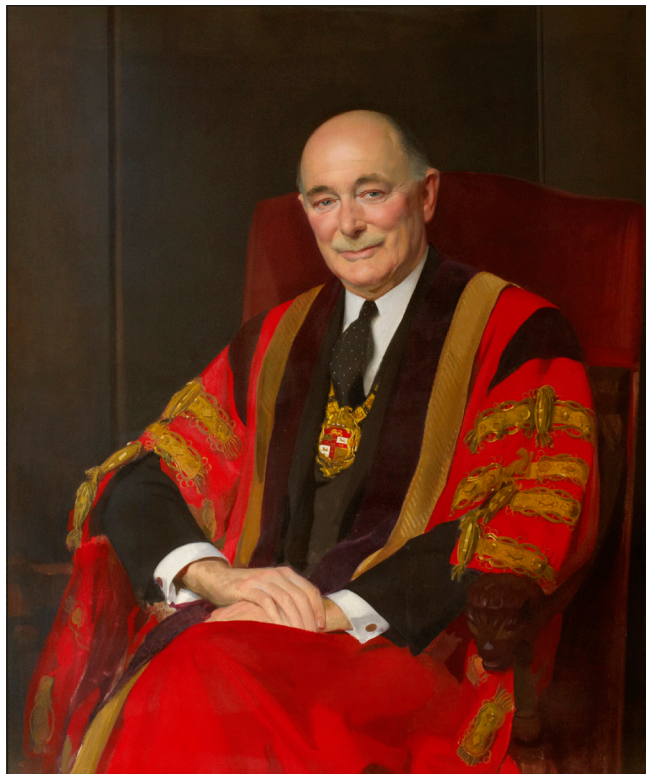
Fig 3. Baron Porritt of Wanganui and Hampstead, GCMG, GCVO, CBE (1900-1994) 13 . Portrait, oil on canvas, 128 x 93 cm, 1964-65, by Sir James Gunn, RA. Reproduced with permission of the Hunterian Museum, Royal College of Surgeons of England, solely for this Medical History. Arthur Espie Porritt was born in Wanganui; his father was a surgeon as was his maternal grandfather. His commendable academic and athletic performances led to a Rhodes to Magdalen, Oxford. At the 1924 Paris Olympics he took a bronze in the 100 meters. Although a knee problem prevented further competition, he served as captain of New Zealand's Olympic Team in Amsterdam in 1928, the year he qualified BM from Oxford. Through house jobs at Mary's and after being Assistant Director of the Professorial Unit, he became surgeon to Mary's and then Surgeon-in-Ordinary to the Duke of York, later HM King George VI. Placed by Hood in the BEF2, he became known to Ulstermen Brooke, Alexander and Montgomery. In North Africa with Montgomery he was chosen as Surgeon in Chief Designate to SHAEF to help Montgomery and Eisenhower 14 .

and the deployment of penicillin and sulfonamides and above all blood and plasma were delineated. "Whole blood will be an item of medical supply and will be distributed through medical supply channels. It will be given the highest priority in transportation" 9 . A ten-day supply of blank forms and stationery were to be stocked in advance dumps and a month's